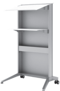
rear view CVML