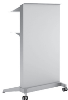
front view CVML