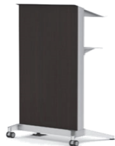
front view CVML